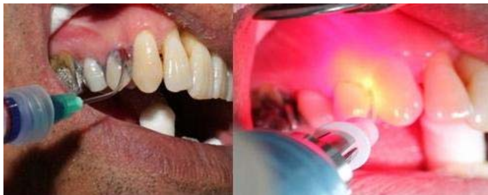
Figure 1. Application of tolonium chloride in the deepest part of the pocket (left), followed by laser irradiation (right).

No additional procedure was carried out on the con-