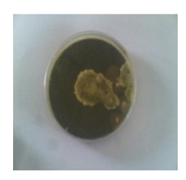
Plate 2. Ethylacetate Leaf Extract: Growth Observed with inhibition