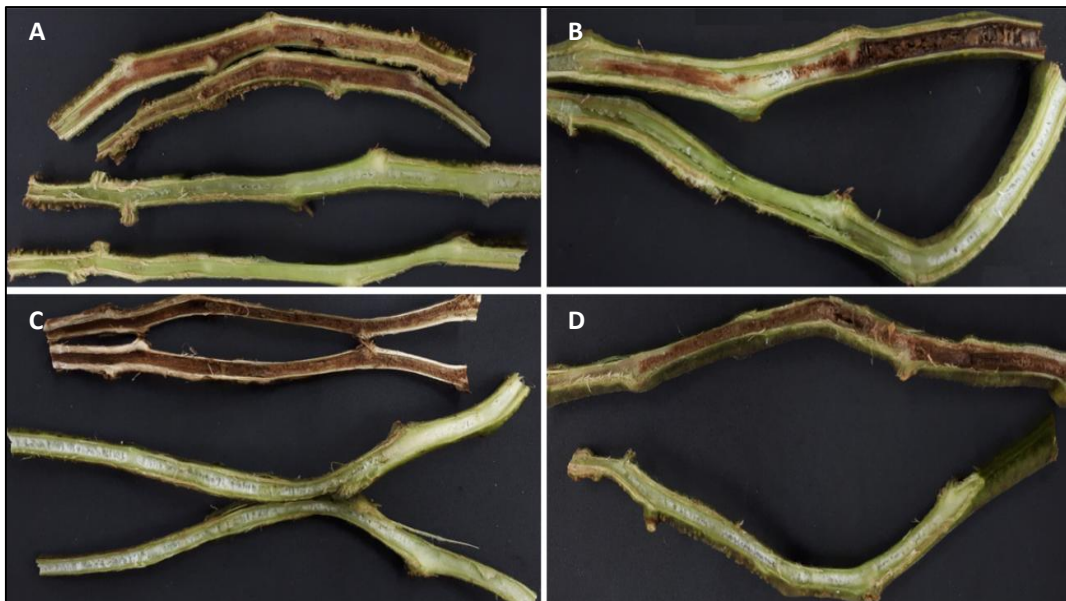
Fig. 4. Pith necrosis in tomato plants inoculated with P. viridiflava compared with the non-inoculated plants

A - Pith necrosis in tomato stems of cultivar paronset; B - Pith necrosis in tomato stems of cultivar compact; C - Pith necrosis in tomato stems of cultivar pizzadoro; D - Pith necrosis in tomato stems of cultivar nagai