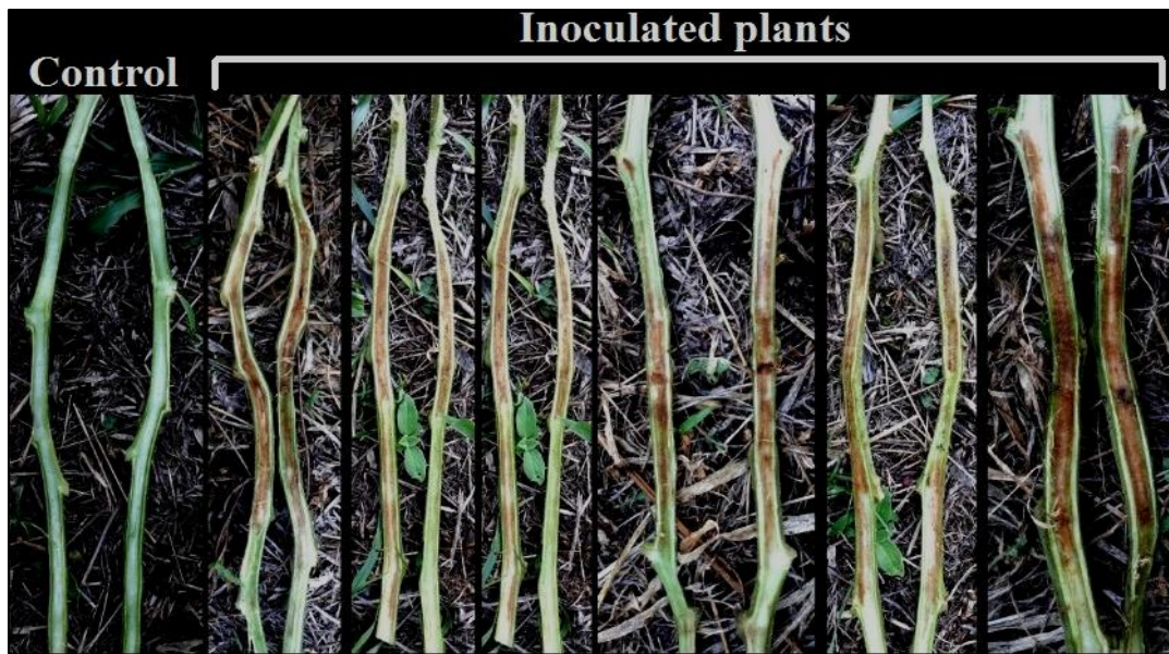
Fig. 2. Pith necrosis in tomato stems, cultivar paronset, inoculated with P. viridiflava compared with the non-inoculated plant