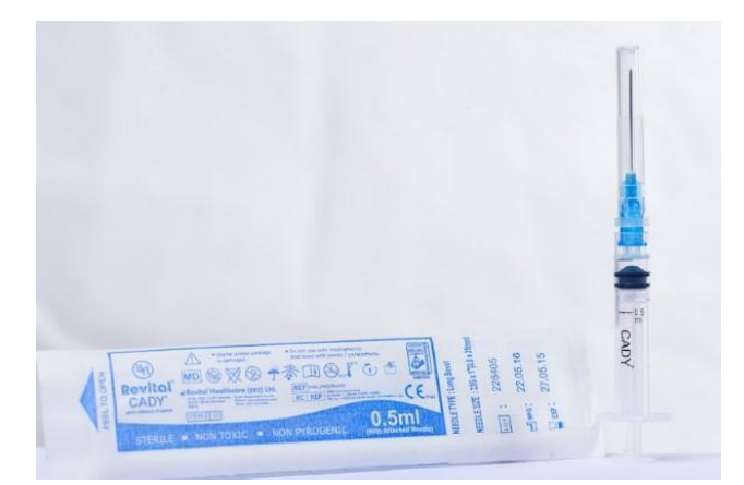
Fig. 1. AD 0.5 ml syringe

Sharma et al.; J. Adv. Med. Pharm. Sci., vol. 26, no. 8, pp. 20-37, 2024; Article no.JAMPS.120853