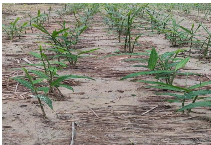
Plate 1. General view of experimental plots