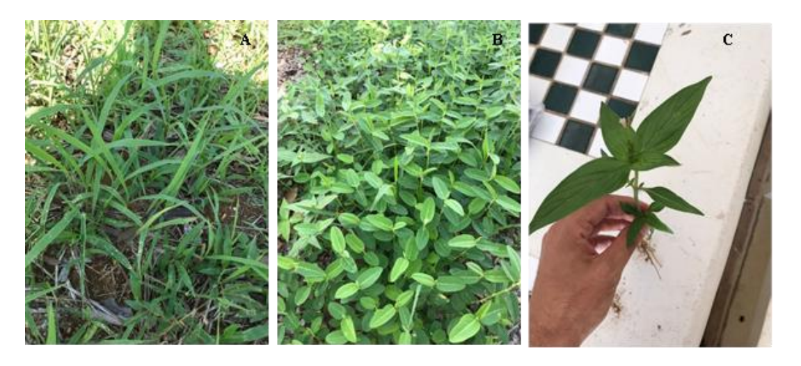
Fig. 1. Weed species in the studied area and which germinated in the control: A - crabgrass ( Digitaria horizontalis ), B - forage peanut ( Arachis pintoi ) and C - roundworm ( Spigelia anthelmias )

Rodrigues and Abbade; J. Adv. Biol. Biotechnol., vol. 27, no. 7, pp. 1464-1469, 2024; Article no. JABB. 119851