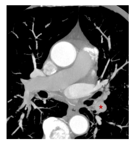
Fig. 3. Coronary CT Scan, axial view just under the pulmonary artery branching showing the arterial confluence (red star) created by the CBF near the left atrial appendage. MIP 6 millimeters

Fig. 2. Coronary CT Scan, coronal reconstruction showing the CBF (blue arrow) originating on the lower surface of the aortic arch