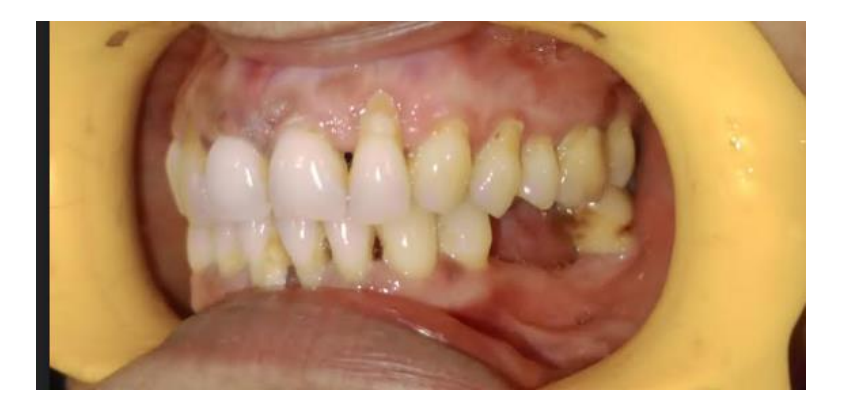
Fig. 1. Missing 35 and 36

Bargoti et al.; Int. J. Res. Rep. Dent., vol. 7, no. 1, pp. 63-68, 2024; Article no.IJRRD.117309