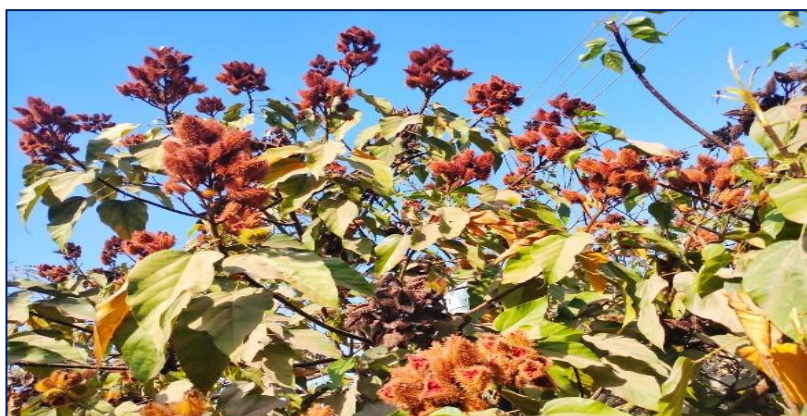
Fig. 3. Bixa orellana tree bearing fruits

Data presented in Table 1 reveal a difference between pre-sowing treatments for the shoot length of Bixa orellana L. The T1 treatment exhibited the highest shoot length. However, this was followed by the T5, T2, T4, and T3 treatments in descending order. The T6 treatment exhibited the least shoot length.