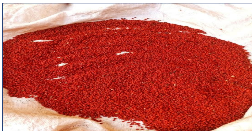
Fig. 4. Seeds of Bixa orellana L.