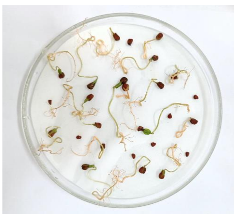
Fig. 2. Germinated seeds of Bixa orellana L.

The peak value was calculated as the maximum mean daily germination reached at any time during the period of the test [21]. In order to compute the germination index, the total number of seeds that germinated at the conclusion of the experiment was divided by the amount of time it took for 50% of the seeds to germinate.