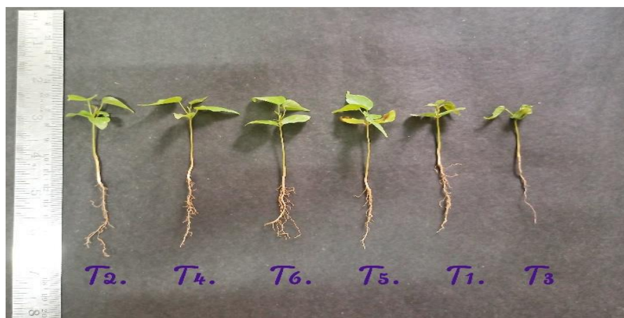
Fig. 6. Measurement of seedling growth parameters across different treatments