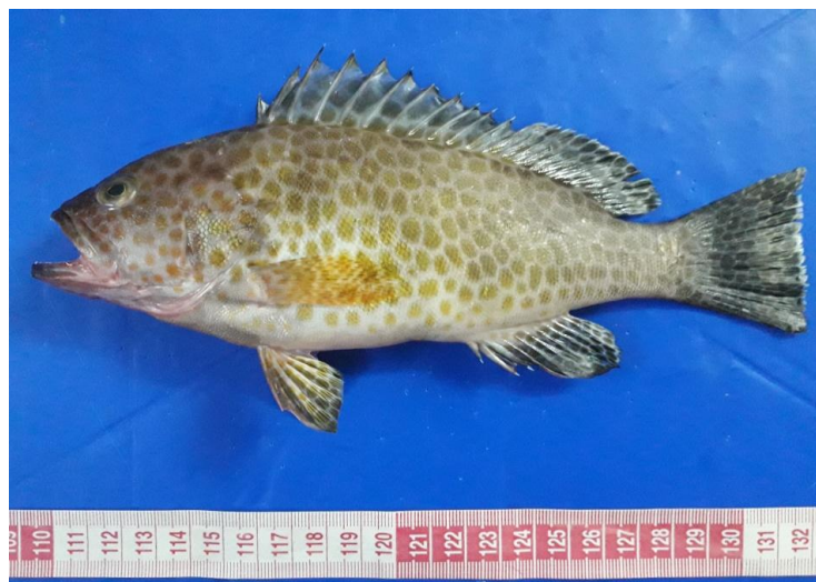
Fig. 2. Epinephelus areolatus . Specimen caught from the coast of Syria