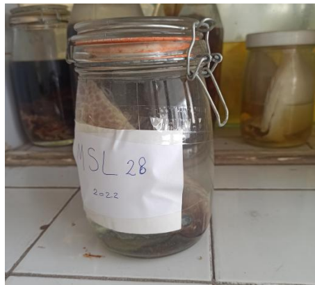
Fig. 3. Epinephelus areolatus . Reference number MSL 28-2022