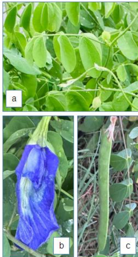
Fig. 1. Clitoria ternatea plant part: a) leaf and vines, b) Flower and c) Pod

regions with full sunlight or partial shade, and its seed germination typically takes around 1-2 weeks, with flowering occurring approximately 4 weeks after germination [9,10,11,12]. This plant exhibits several variations with different flower colors, including light blue, dark blue, white, and mauve, each of them measuring 4-5 cm in length (Fig. 1). Compounds reported to be found in the flowers are ternatin anthocyanins and various flavanol glycosides of kaempferol, quercetin and myricetin [4,13,14]. The leaves of Clitoria ternatea are pinnate, composed of 5-7 leaflets, and have an elliptic-oblong shape with lengths ranging from 2.5 to 5.0 cm and widths from 2.0 to 3.2 cm. The plant produces flat, linear, and beaked seed pods, which have a length range of 5-7 cm and are edible when tender. The seeds are oval-shaped and have a blackish or yellowish-brown color, with lengths varying from 4.5 to 7.0 mm and widths from 3 to 4 mm. Clitoria ternatea has a taproot system with numerous slender lateral roots [15,4].