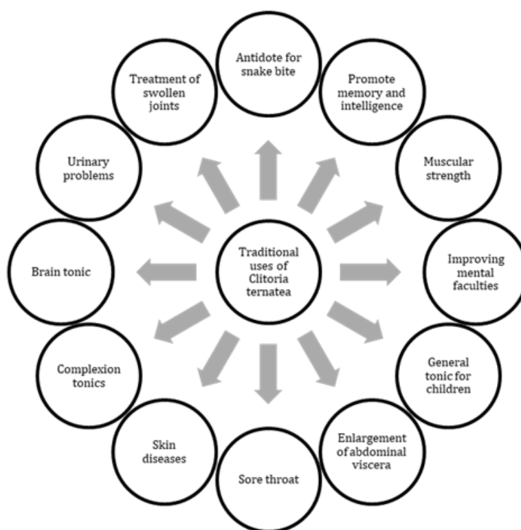
Fig. 2. Traditional uses of Clitoria ternatea

Root was used for the treatment of ascetics, enlargement of the abdominal viscera, sore throat and skin diseases. They were also used as purgative, but because, they cause griping and tenderness, they were not recommended. Root was administered with honey and ghee as a general tonic to children for improving mental faculties, muscular strength and complexion tonics. Seeds and leaves were widely used as a brain tonic and to promote memory and intelligence. Juice and flowers were used as an antidote for snake bite. Seeds were used in swollen joints; crushed seeds are taken with cold or boiled water for urinary problems [23,24,25,26].