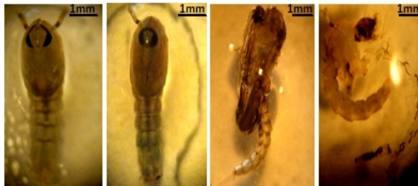
Fig. 3. Morphogenic aberrations after treatment with kinoprene in Cx. pipiens (A: Untreated pupa; B: Pupa from treated series with one air trumpet; C: Interrupted metamorphosis; D: Larva-pupa intermediate from treated series)