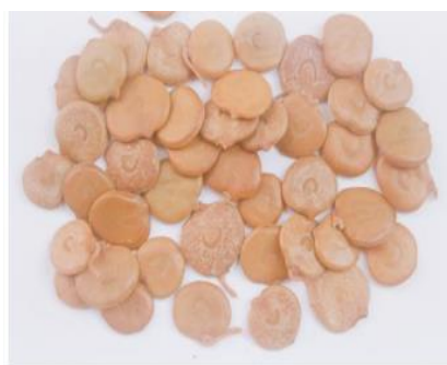
Plate 2. Seed of Acacia Senegal