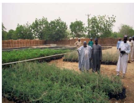
Plate 1. Supervision of planted seedlings in a nursery