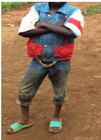
Fig. 4. A sickle cell child (7years 1month) with the right leg bigger than the left leg [25]. (With the parents' premission).

The chronic demonstrations of sickle cell disease associated with a delay of growth (size and weight) [23] and a pubertal delay are frequent during childhood and in the beginning of puberty. This is due to the increasing elimination of the essential amino acids by urinary excretion [24] (Fig. 4).