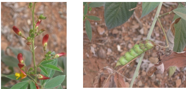
Fig. 8. Cajanus cajan : flowering apex and a fruit on an individual.

The phenylalanine of Cajanus cajan (Figure 8) is responsible for the in vitro anti- sickle cell activity of the plant [43]. The molecule and the aromatic amino acids are possible inhibiting the setting in gel of de-oxy hemoglobin S and to prevent the formation of the deformed cells [19]. It is the same property found in the extracts of Psidium guajava and three other medicinal plants which exhibited the highest capacity to reduce polymerization of desoxyhemoglobin molecules [44]. The addition of seeds of Cajanus cajan in the food of the sickle cell patient should compensate the urinary losses in amino acids to make up for this delay in growth, at the same time to decreasing the painful crises.