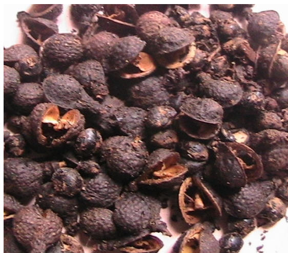
Fig. 7. Zanthoxylum xanthoxyloides represented by its dried fruits showing the aspect of an open-mouthed (ga'chou of the Bamilekes).

scientific research. Its extract inhibits formation of sickle cells under severe hypoxia at varying degrees, with only 0-5% sickle cells in the crude extract at 60 minutes compared with untreated S/S cell suspensions which had over 80% sickle cells. These results further indicate the possibility of Carica papaya leaf extract as potential phytotherapy for sickle cell anemia [39]. The deformed red blood cells regain the normal round shape under the acute action of the hydroxy-2-methyl-benzoic acid extracts of the roots of Zanthoxylum xanthoxyloides [40-42] (Figure 7).