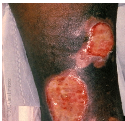
Fig. 5. Leg of adult sickle cell patient showing lesions as a result of necrotic crisis (Photo Nforbi, Bamenda Regional Hospital, February 2001). Two sores due to the blockage of blood vessels which wear down the tissues of the affected area. Leg is swollen and the area around the sores is black due to shortage of blood causing the death of cells (photography and publication with the premission of the patient).

Sickle cell osteopathy frequently presents an aseptic osteonecrosis of the femoral head [26-29] (Table 1). The deformed red blood cells are rigid: they hook up and obstruct the blood vessels. These accidents are called "vaso - occlusive crises". Preferential localizations of these vaso-occlusive crises exist at the level of the vessels of the limbs and extremities (feet, hands). Their closure sometimes causes severe pains; the concerned limb can be hot, swollen, with its mobilization can become very painful and necrotic [30] (Fig. 5).