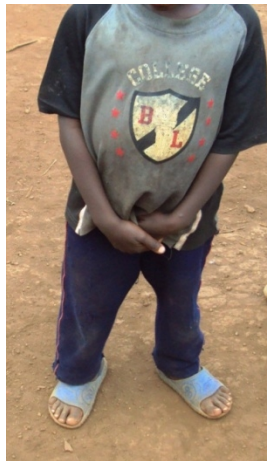
Fig. 3. A sickle cell child (5years 2months) looking healthy but has a big belly (with splenomegaly) and yellow eyes (anemia). The parent refused photography bare-chested. (With the parents' permission).

In unaffected men, the level of normal hemoglobin is between 14 and 16 g/dL, while it is between 12 and 14 g/dL in woman. In Bamenda, as in other tropical zone, anemia is aggravated by malaria, or by digestive defects. Hepatomegalia (big liver) and splenomegaly (increase of the size of the spleen, provoked by the deformed red blood cell destruction) are present in all age groups [20-22] (Fig. 3).