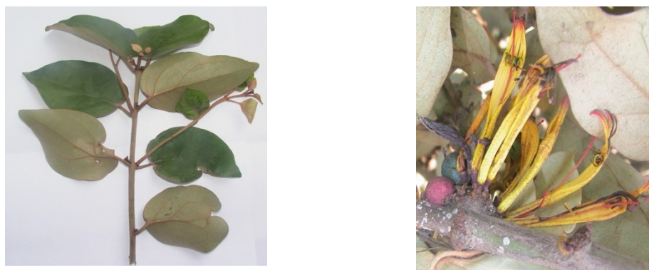
Fig. 6. Phragmanthera capitata : Leafy branch; yellowish axillary umbellate and a red fruit.

During the fieldworks, the traditional healers, outside of the studied thematic, informed on the virtues of Phragmanthera capitata in the treatment of Diabetes. It is still a new reported property of this plant in the treatment of sickle cell disease (Fig. 6).