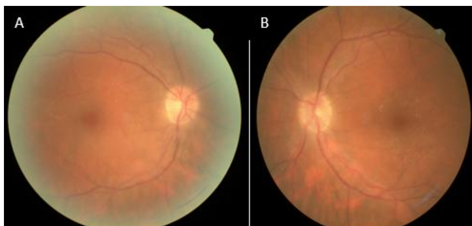
Fig. 3. Photoreinography of both eyes after 4 months of treatment with corticosteroids and ciclosporin A: right eye /B: left eye

great concern [16]. In case of failure, ciclosporin A is used, a very effective but renal toxic drug that requires careful monitoring of renal function and blood pressure [16,17]. Currently, there is no consensus on the modalities of monitoring. The lack of codified rules concerns not only the type of examinations to be performed but also their frequency. Several clinical and paraclinical methods have been proposed, but none has been validated by a prospective study. Rather than a single component, surveillance for CRB should be based on a combination of clinical and paraclinical investigations, and the frequency of surveillance should be tailored to the stage and severity of the disease. Clinical criteria for monitoring include functional signs such as quality of life scale, visual acuity, vitreous inflammation, macular edema, and fundus blotches [5]. However, these criteria may develop independently, so one alone is not sufficient to provide a comprehensive overview. Of the complementary examinations, some provide information about inflammatory activity: OCT evaluates the presence of macular edema, and fluorescein angiography can reveal vasculitis, vascular leakage, or choroidal neovascularization [12]. ICG (indocyanine green angiography) could be used, but no study has been performed in this sense. Fardeau et al. suggested that hypocyanotic stains on ICG might disappear with treatments [18].