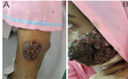
Fig. 1(A, B). Reveals huge warty nodules on her right leg and face

There was no history of systemic expression, pain or fever. She denied any considerable trauma. Physical examination revealed a 10x8 cm dark brown, diffuse and infiltrated plaque involving the anterior aspect of the right leg (Fig. 1A) that had a well-defined but irregular border with marked hyperplasia. In addition there was a large verrucous as well as nodular growth and elevated lesion 25x18 cm on her left face area with irregular border which involved both maxillary and mandibular areas (Fig. 1B).