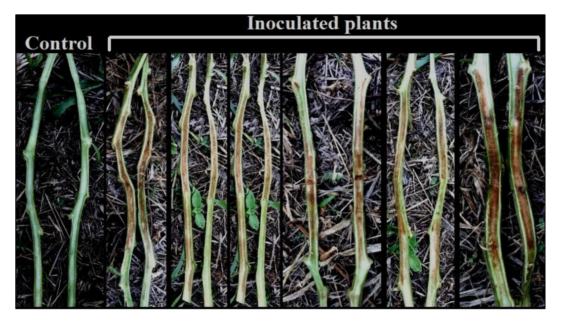
Fig. 2. Pith necrosis in tomato stems, cultivar paronset, inoculated with P. viridiflava compared with the non-inoculated plant