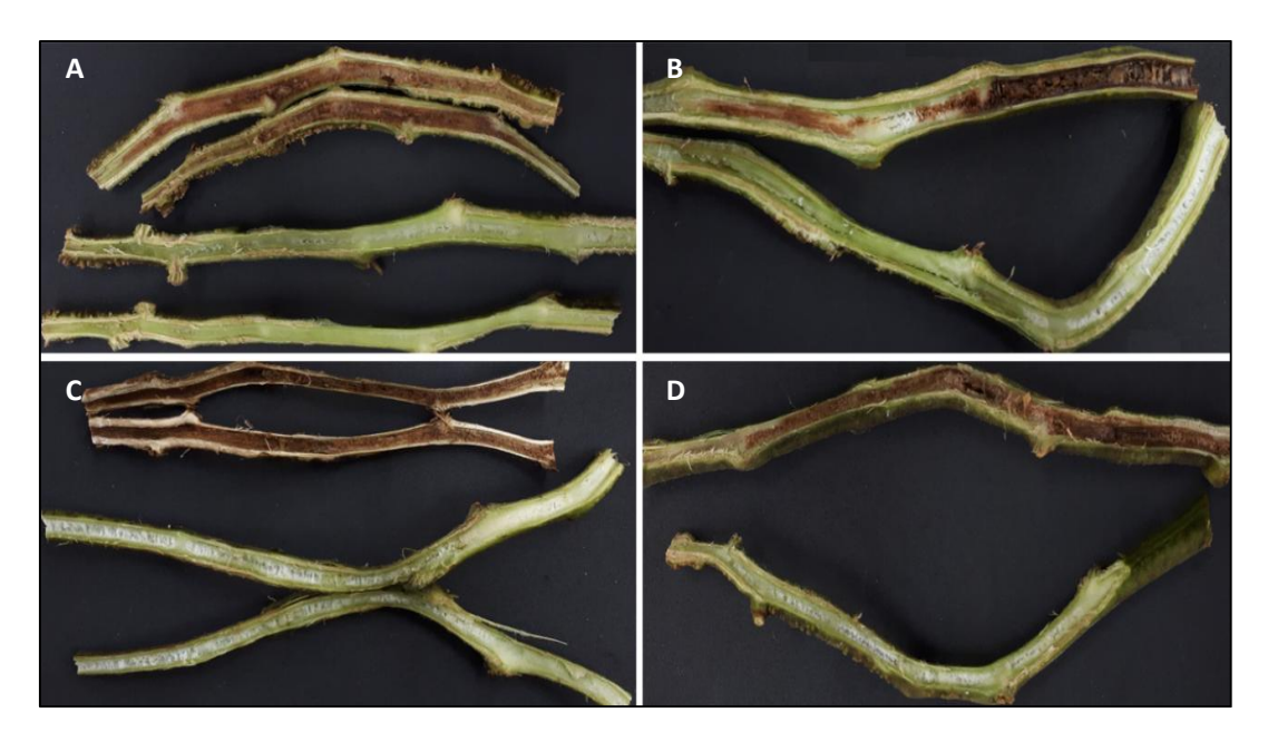
Fig. 4. Pith necrosis in tomato plants inoculated with P. viridiflava compared with the noninoculated plants

Monteiro et al.; AJAHR, 4(4): 1-6, 2019; Article no.AJAHR.52324