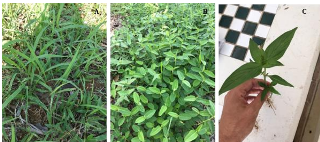
Fig. 1. Weed species in the studied area and which germinated in the control: A - crabgrass ( Digitaria horizontalis ), B - forage peanut ( Arachis pinto ) and C - roundworm ( Spigelia anthelmias )