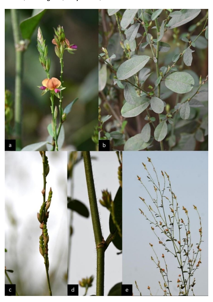
Fig. 1. Alysicarpus rugosus: a) Flower b) Leaves c) Fruits d) Stem e) Inflorescence

Alysicarpus rugosus (Willd.) DC., Prodr. 2:353(1825); Fabricia rugosa (Willd.) Kuntze Revis. Gen. Pl. 1:182(1891); Hedysarum rugosum Willd. Sp. Pl., ed. 4. 3: 1172 (1802).