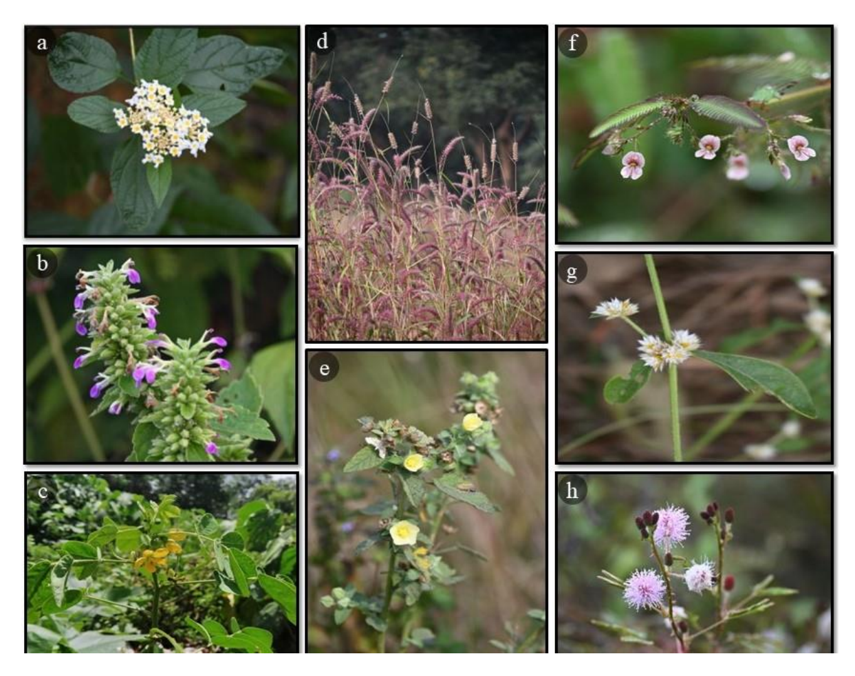
Plate 1. Associated plant species of Alysicarpus rugosus: a) Ageratum conyzoides, b) Anisomeles indica c) Senna tora d) Cenchrus pedicellatus e) Sida cordifolia f) Aeschynomene americana g) Alternanthera sessilis h) Mimosa pudica

Specimen examined: India, Odisha, Sundargarh district, Rourkela Forest Division, Kansbahal, N22°14.966′, E84°39.269′ elevation 217 m, 26<sup>th</sup> November 2023. R.S. Devi 080 (APRFH) (Fig. 2).