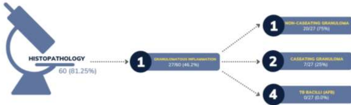
Fig. 2. Demonstration of histopathology diagnosis among patients