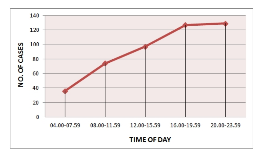
Figure 3. Frequency curve of accidents with time-frame